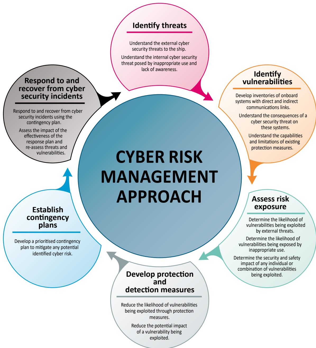
Figure 1: Cyber risk management approach as set out in the guidelines

Some aspects of cyber risk management may include commercially sensitive or confidential information. Companies should, therefore, consider protecting this information appropriately, and as far as possible, not include sensitive information in their Safety Management System (SMS).